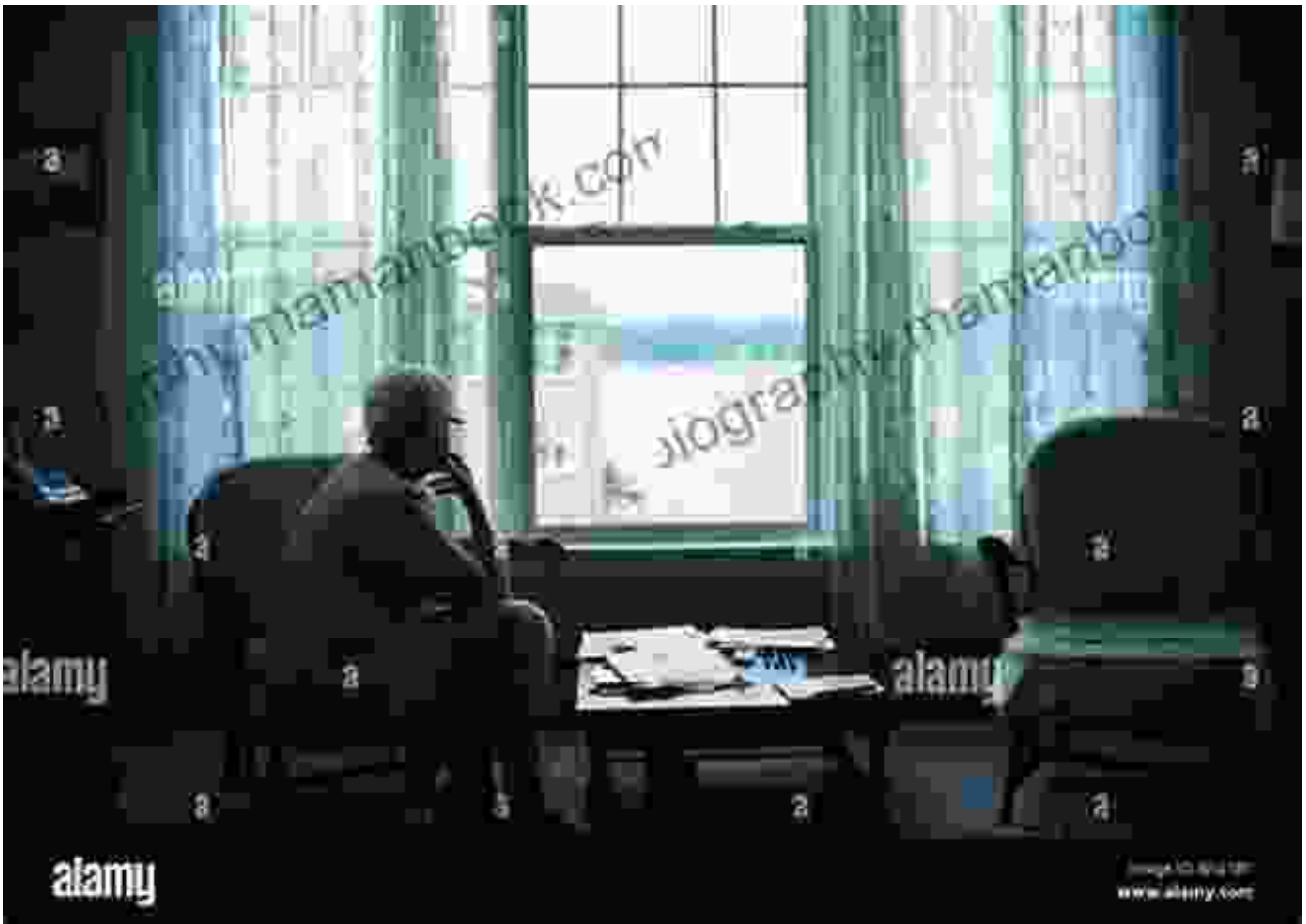
The Old Woman by Moya Cannon