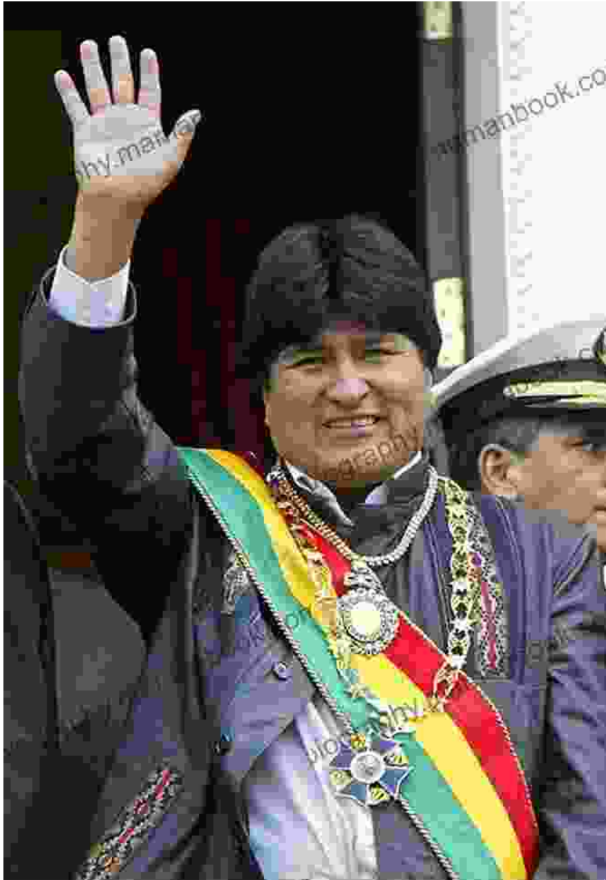
Evo Morales, the first indigenous president of Bolivia.

In the late 1990s and early 2000s, a new wave of democratic governments emerged in Latin America. These governments implemented social welfare programs, reduced poverty, and expanded access to education and healthcare. Economic growth was driven by a combination of factors, including commodity exports, foreign investment, and regional cooperation.